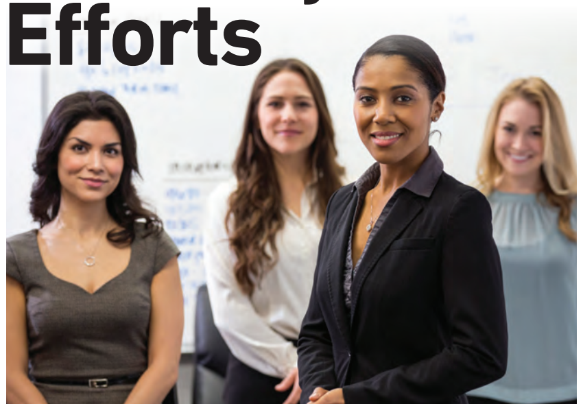
Women and Black, Indigenous and People of Color (BIPOC) owned businesses are growing. Can the captive insurance sector better meet their needs?

NFP Management Corp. has taken great strides to enhance its diversity and inclusion initiatives, showing that such efforts in captives are a necessary step forward. By Autumn Demberger