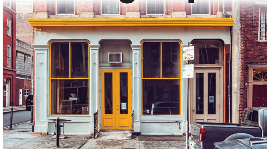
Continual hardening of property insurance markets is one factor driving the trend.

s the insurance marketplace continues to harden, it should come as no surprise that more companies are looking to captives as an answer to rising rates and shrinking capacity. Of note is that many of the new captives domiciled in Vermont last year were in real estate or construction.