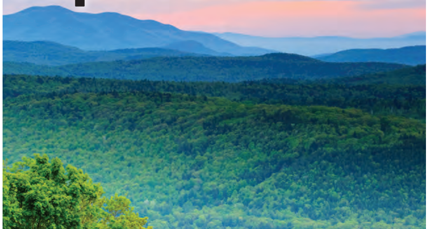
Vermont has long been the home for captives in the U.S. Its private infrastructure is key to its 40-year-long success.