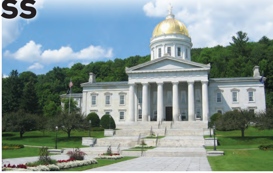
Vermont marks 40 years in the captive insurance industry.

he state of Vermont has reached a significant milestone in its development. This year marks 40 years since its legislature passed the Special Insurer Act of 1981, enabling businesses to form captive insurance